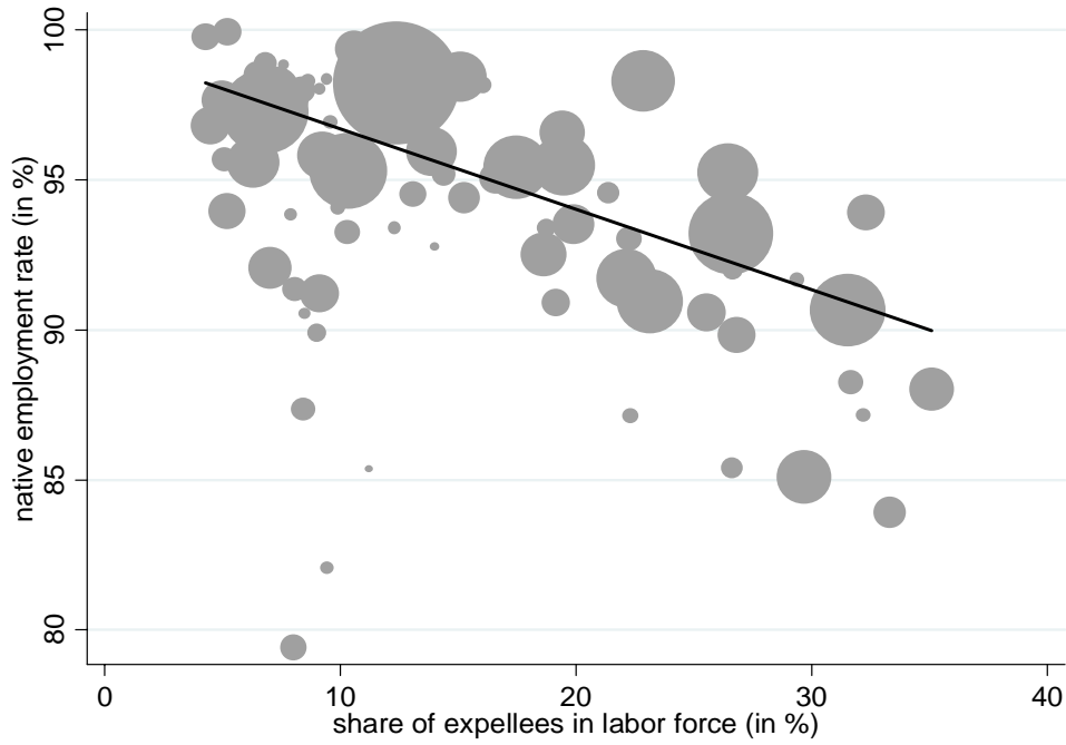
FIGURE 2: EXPELLEE INFLOWS AND NATIVE EMPLOYMENT, LINEAR FIT

Notes: Each point refers to a state-occupation cell. The size of each point indicates the size of the native male labor force in the cell. The regression line weighs the data by the native male labor force in each cell.