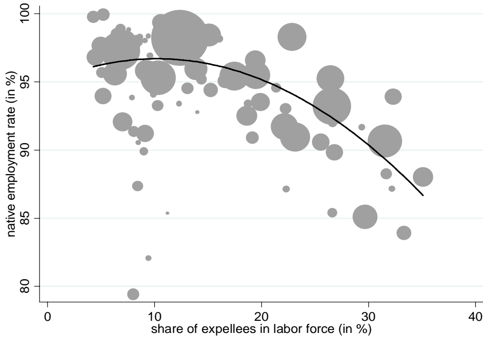
FIGURE 3: EXPELLEE INFLOWS AND NATIVE EMPLOYMENT, LINEAR-QUADRATIC FIT

Notes: Each point refers to a state-occupation cell. The size of each point indicates the size of the native male labor force in the cell. The regression line weighs the data by the native male labor force in each cell.