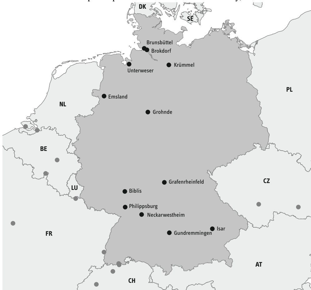
FIG. 1: Nuclear power plant sites in and close to Germany, March 2011

Note: German nuclear power plant (NPP) sites are marked by black dots and with name. Foreign NPPs are marked by grey dots and without name.